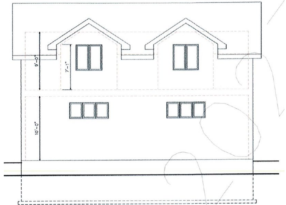
PROP. WEST ELEVATION SCALE: 1/4" = 1'-0"