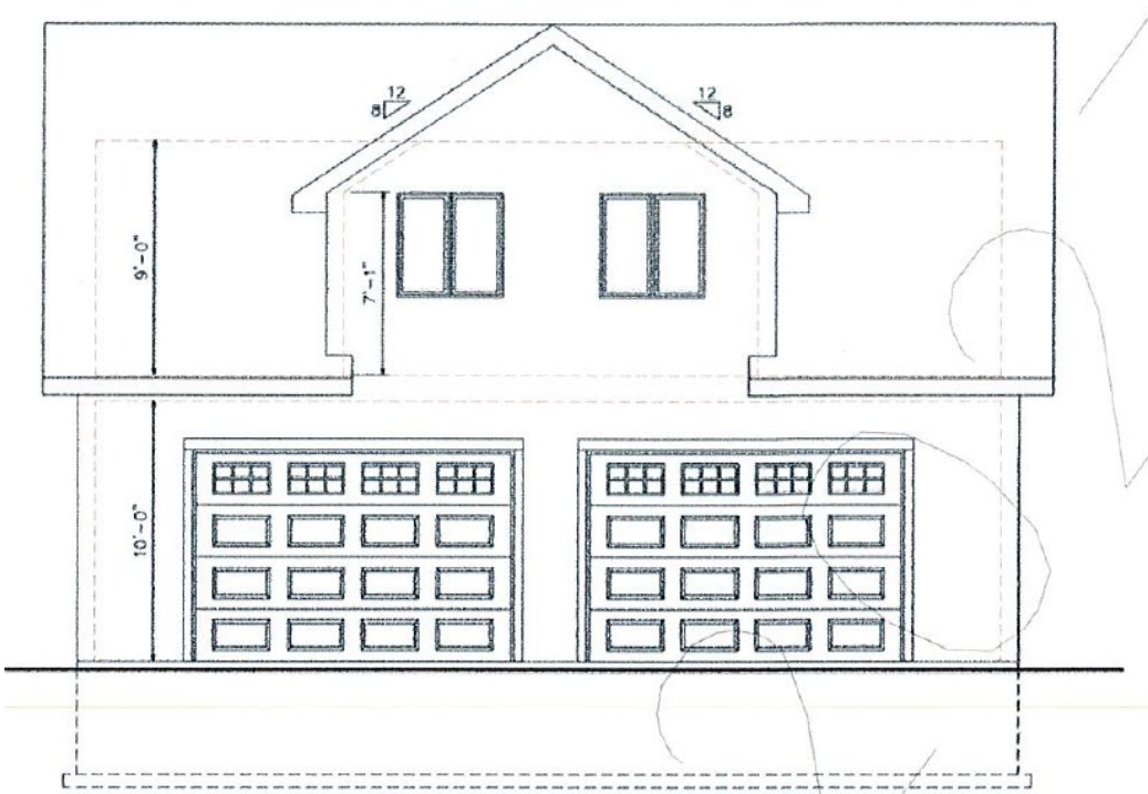
PROP. EAST ELEVATION SCALE: 1/4" = 1'-0"