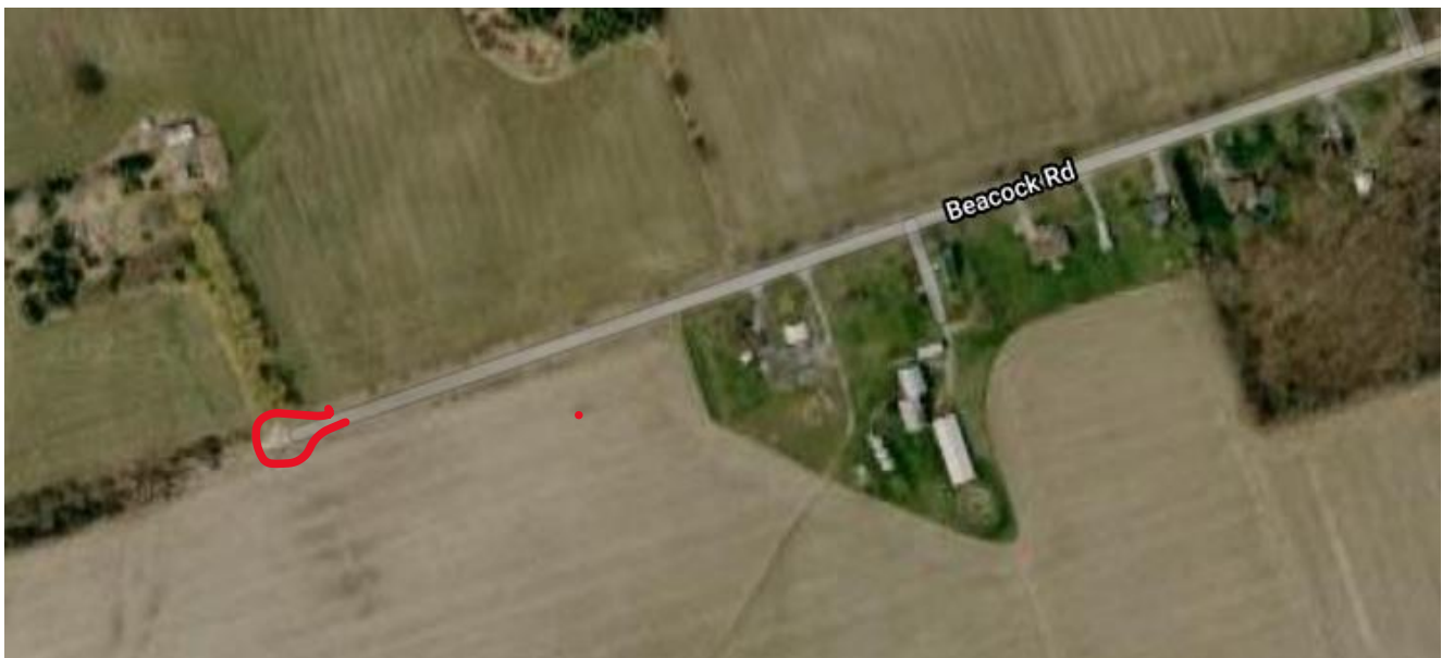
Figure 2: Proposed Location of Beacock Road Turnaround