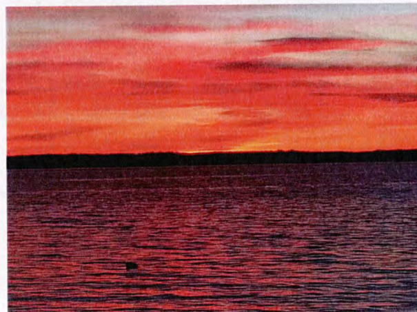
Sunset on Manitoulin Island