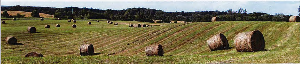
Hayfield at Scotsdale Farm in Georgetown