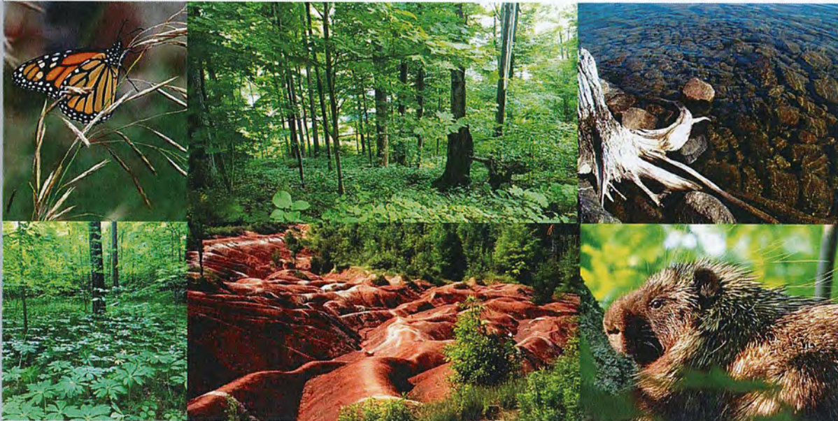
From top left, clockwise: Monarch butterfly; the Ellis Property; Along the shore of the Boothby Property; Porcupine; the Cheltenham Badlands; Mayapple found at the Fleetwood Creek Natural Area